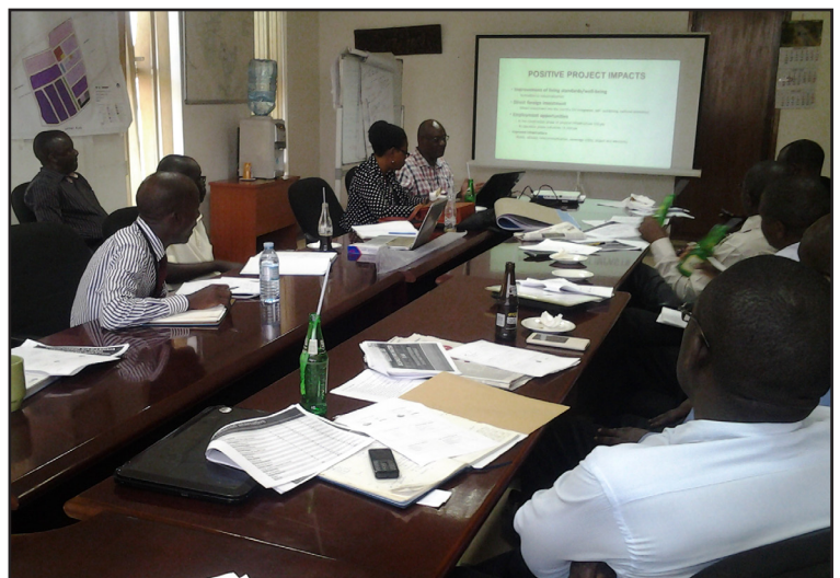
Draft Plan Handover Meeting at the UIA Head Office in Nakasero

The park will be located 12 kms South of Moroto Municipality along Moroto - Soroti highway. The 417 acre site lies on the boundary between Moroto and Napak districts.